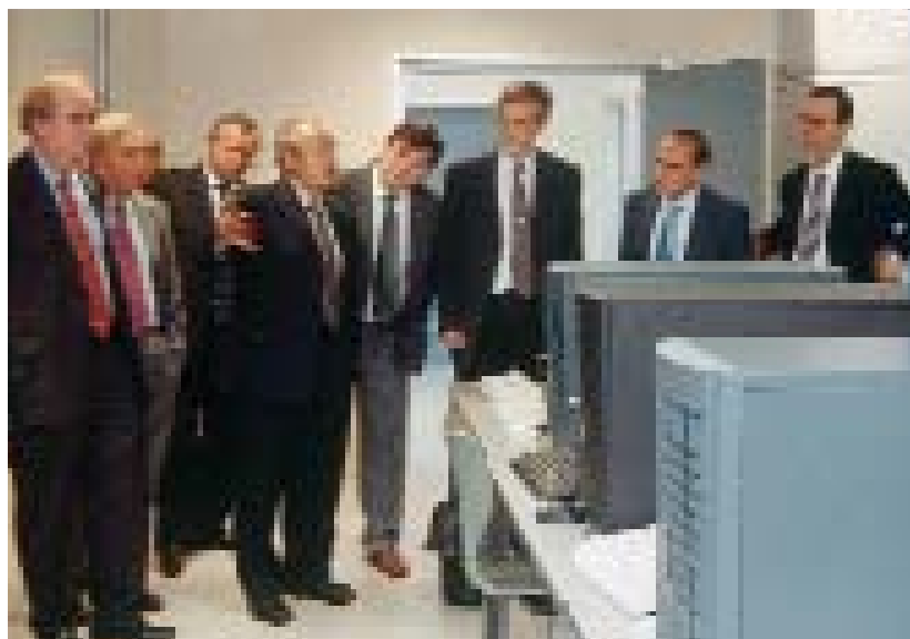
Patrons and board members examine the first installed units at the opening of the Computation Center.

The first phase of the new DIPC Computation Center was inaugurated at DIPC in July 2003. The institute's own calculation center is connected to the general service of the University of the Basque Country (UPV/EHU) and is optimized for