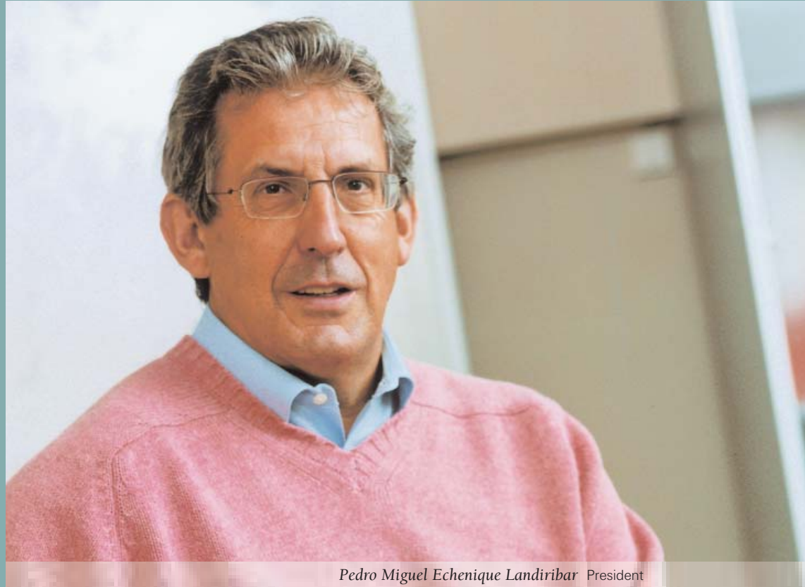
Pedro Miguel Echenique Landiribar President

DIPC started as an intellectual center with the principal aim of promoting and facilitating the development of basic and oriented research in materials science to the highest level.